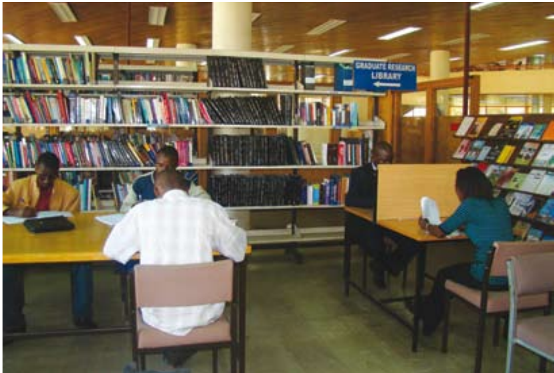
Graduate Research Library Conducive environment for researchers